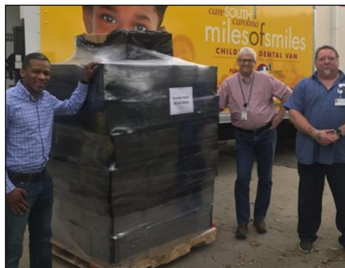
Harbor Freight Tools donated much needed PPE to CareSouth Carolina during the pandemic.

Thank You Harbor Freight for your community minded spirit!