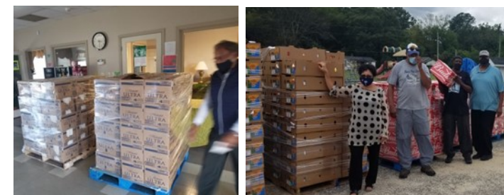
Lee Co. Council on Aging