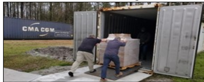
New Freezer for Food Storage

Malloy Foundation as well as Hartsville/Chesterfield County United way, Duke Energy, Vantage Point to name a few. Local business and industry supported our mission to supply emergency foods and PPE to so many in the region. It was both a time when everyone pulled together and worked the problems one by one and add-