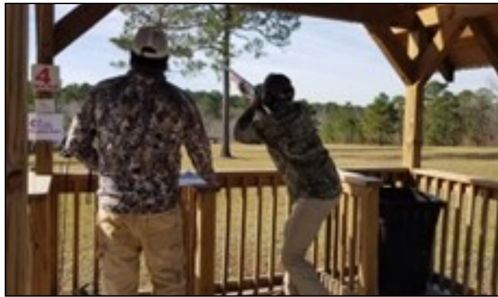
The foundation's annual Clay Shoot will be held December 2 at Moree's Sportsman Preserve in Society Hill.